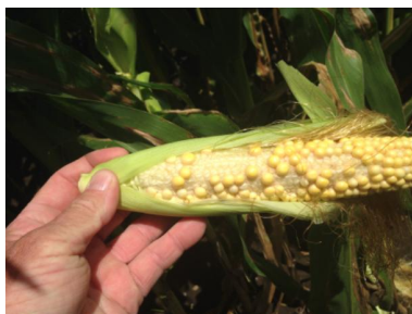
Figure 6. Poor kernel set as a result of silk damage caused by corn rootworm.

Scout to Suppress Egg-Laying - An additional reason for managing beetles is for the suppression of egg-laying which may prevent large populations. But keep in mind, successful adult management programs require a grower commitment to regularly scout crops throughout the grain fill period.