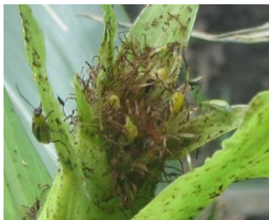
Figure 5. Adult corn rootworm beetles feeding on silks.

Scout and Protect Silks - Adult CRW populations should be monitored around tasseling to determine if adult control measures are warranted to protect silks from clipping (Figure 5). Silk clipping can prevent ovule fertilization, which results in aborted kernels (Figure 6). In some regions, the economic threshold of five beetles/plant may justify a foliar insecticide application to protect silks. 4 University guidelines should be followed for the thresholds. Adult scouting can also help determine the potential for infestation in future corn crops.