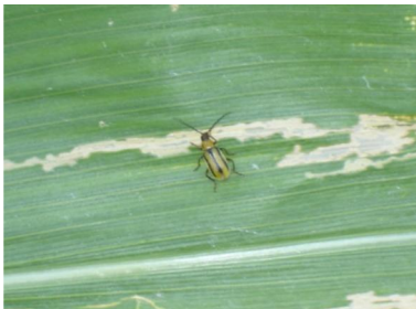
Figure 2. Western corn rootworm adult.