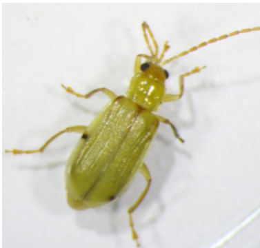
Figure 1. Northern corn rootworm adult.

The Northern corn rootworm ( Diabrotica barberi Smith & Lawrence) (NCRW) and the Western corn rootworm ( Diabrotica virgifera virgifera LeConte) (WCRW) are the prominent corn rootworm (CRW) pests in the Midwestern states. The NCRW adult is cream to tan in color upon emergence, but turns to pale green and is about 1/4 inch long (Figure 1). The WCRW adult is yellow to green in color, has black stripes on the wing covers, and is about 5/16 inch long (Figure 2). 1 The male's stripes usually appear wider and may coalesce. The females of the two species are generally larger than the males.