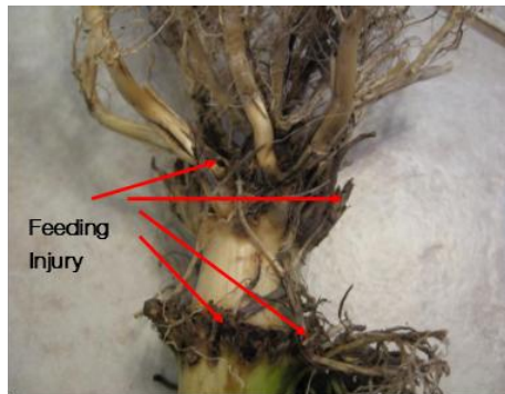
Figure 4. Rootworm feeding injury.

Scout and Protect Roots - The most notable injury from CRW larval feeding is the injury to the root system (Figure 4). Root injury subjects the plant to increased effects from drought, compaction, inadequate fertility, and other stresses, and can increase the potential for significant yield reduction. Root lodging is also a possibility, which can make harvest difficult. In