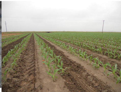
Figure 2. Single-row (right) and twin-row (left) corn plantings.