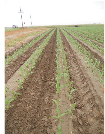
Figure 3. Uniformly planted twin-row corn.