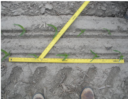
Figure 1. Example of the uniformity and distribution of corn plants in twin-row planting.